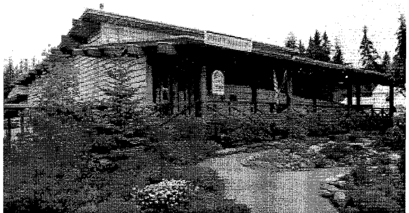
Pratt Museum, Homer, one of the recipients of this year's Grant-in-Aid awards.

The Institute of Museum and Library Services has launched a monthly email newsletter, The Primary Source . The Primary Source explores how museums and libraries across the country use IMLS awards to further their service to the public. The newsletter provides the latest information about IMLS activities, grant programs, and publications, and showcases best practices. Every issue contains valuable links to information on the IMLS web site.