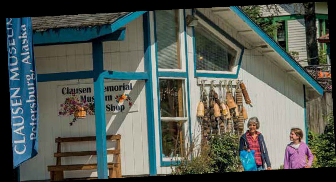
Above: vintage cork buoys adorn the remodeled entrance of Petersburg’s museum, built a half century ago.

The building now is about four times larger than it was initially, thanks to new wings that were added piecemeal in the 1970s, '80s and '90s. But in truth the Petersburg museum is still just a “modest wooden bungalow,” except now it’s a fifty-year-old bungalow.