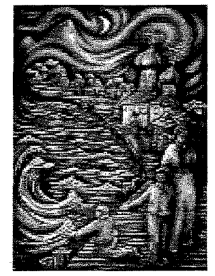
Only the Children See

artist works with charcoal and colored pencil drawing, as well as with woodblock prints, monotypes, and etchings. Her colorful, fluid style is gaining recognition