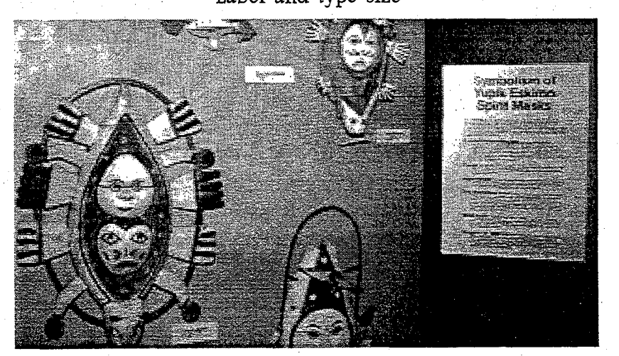
Exhibit showing object labels and secondary text label.

Labels need to be understandable to a wide range of ages and educational backgrounds. Various formulas have been developed to relate sentence length and number of syllables to an average target age or educational level. Using these formulas can be helpful but may also prove time consuming for a small museum. One should, however, strive to keep sentences simple and direct. Avoid too many multi-syllable words and use direct action verbs. Avoid trying to squeeze in extra information. Label writing should also be a group effort. Labels need to be proof read, often a number of times and by more than one person. Label and type size