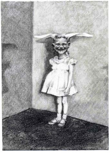
I Have the Capacity for Optimism (detail), by Jane Terzis. Graphite on paper.

The online exhibits combine photographs of the artworks and gallery installations with artist statements and interviews. Numerous other Web exhibits are also available. Visit: http://www.museums.state.ak.us/online.htm