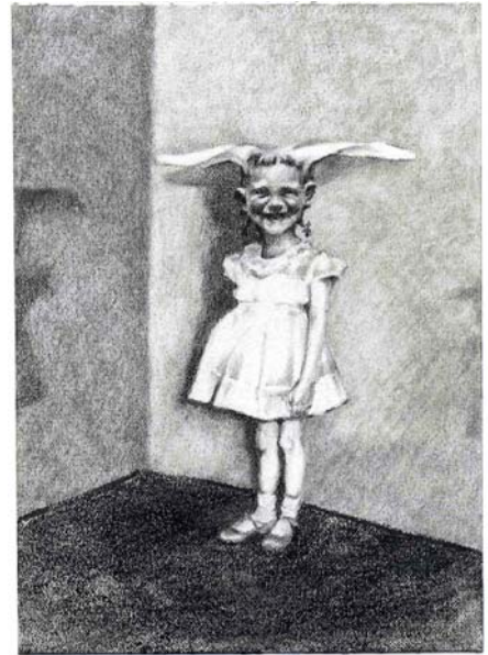
I Have the Capacity for Optimism (detail), by Jane Terzis. Graphite on paper.

The online exhibits combine photographs of the artworks and gallery installations with artist statements and interviews. Numerous other Web exhibits are also available. Visit: http://www.museums.state.ak.us/online.htm