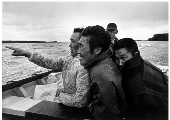
Entering Church Slough, Kuskowim River, is featured in Alaska Positive: 35 Years of Award-Winning Photographs.