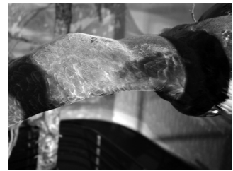
Eagle wing before removing dust...