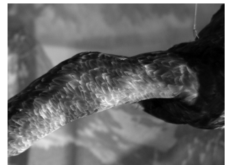
... and wing after dusting.