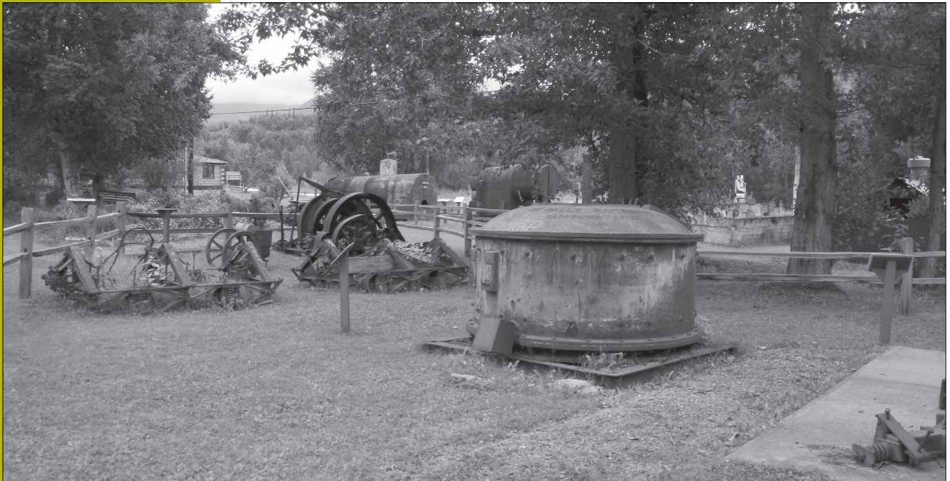
Several artifacts in the Alpine Historical Park collection.

The last few years of developments at the Alpine Historical Park are even more significant when one considers their limited resources: one paid employee (part-time), free visitor admission, and a limited season of May through September. Taking full advantage of the Grant-In-Aid program of the Alaska State Museum, Alpine Historical Park has implemented advancements making the Mat-Su Valley's mining history more accessible and sustainable.