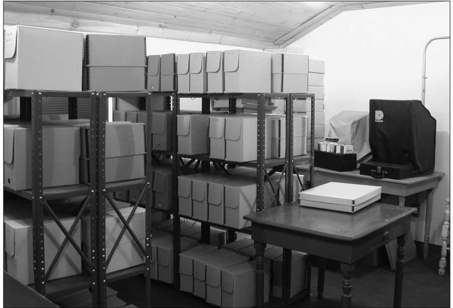
Neat and tidy rows of archival material line the walls of Eagle's archives storage housed in a historical log cabin.

When my journeys in Alaska ended, I was sorry to leave. I had enjoyed my time in all of the locations, and I felt that there was still much more work for me to do. I would love to return and continue such interesting work, but meanwhile it is good to know Alaskan collections are being cared for by such dedicated people in institutions all across the state.