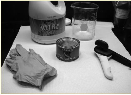
Opening a salmon can.