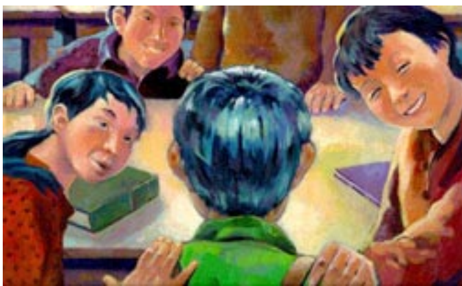
Benny wins the contest