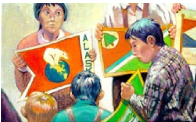
Students share their entries