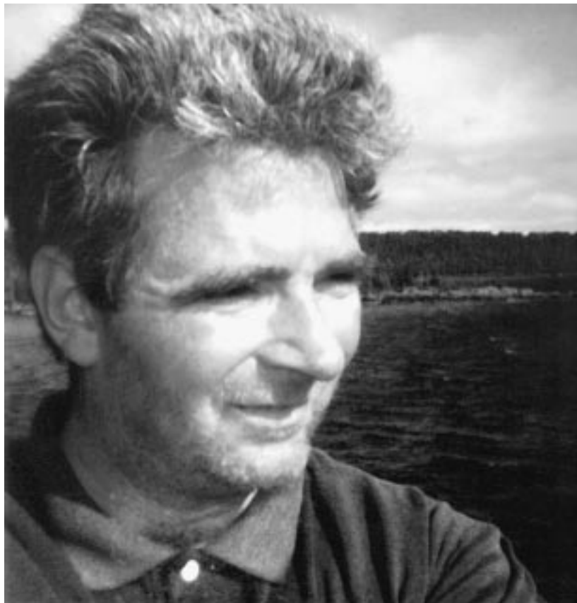
Self-portrait, Polaroid, Isle Royale National Park.

"...I remember developing my first roll of film, making my first contact sheet, and I was hooked. I just loved it."