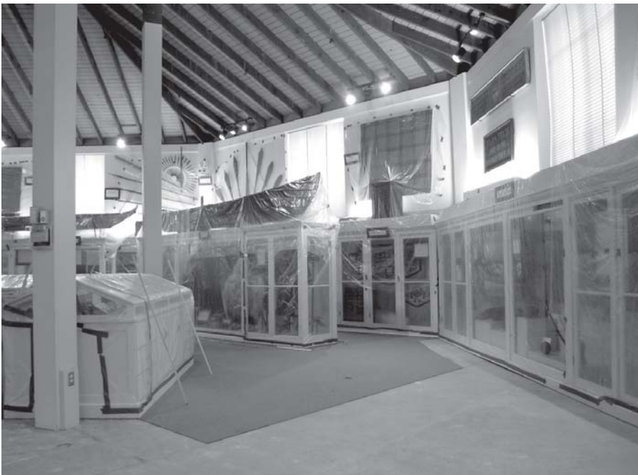
The gallery of the Sheldon Jackson is resurfaced with new carpeting.