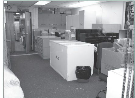
Alaska State Museum conservation lab before (top) and after renovation (below).

Delaware art conservation program. They will spend several weeks in Juneau working on the collection and learning about gathering and processing spruce root and an introduction to weaving from Tlingit/Haida weaver Janice Criswell. Then they will travel to Sitka to work on the Sheldon Jackson Museum collection and learn more about weaving from Tlingit weaver Teri Rofkar until mid-August.