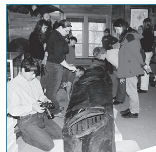
Community members examine the surface and construction of the baidarka.

In November 2007 the Baranov Museum embarked on a project to restore the baidarka. This is the first facelift it has seen since 1978. With the baidarka now needing attention again, the Baranov Museum