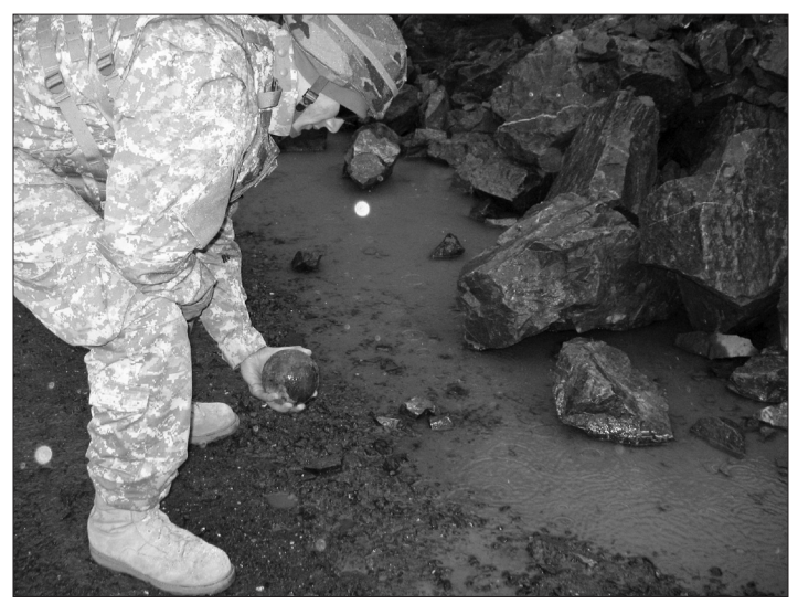
An EOD team member readies the first of six cannonballs to be detonated.