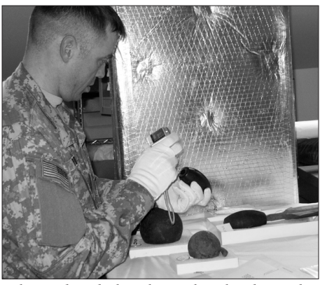
Taking a closer look at the Ketchum hand grenade previously thought to be a whale bomb. V-A-46