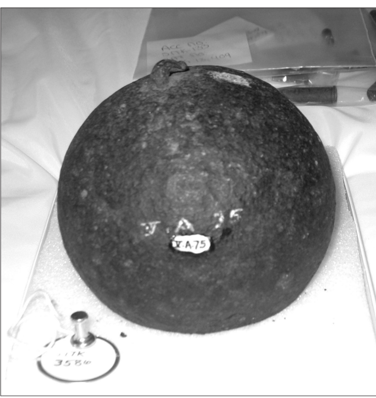
Cannonball with small hook-like appendage. V-A-75.

team. I asked if she would like to check the park's armaments. She responded that this was the perfect opportunity. I also contacted the Sitka Historical Society to see if they