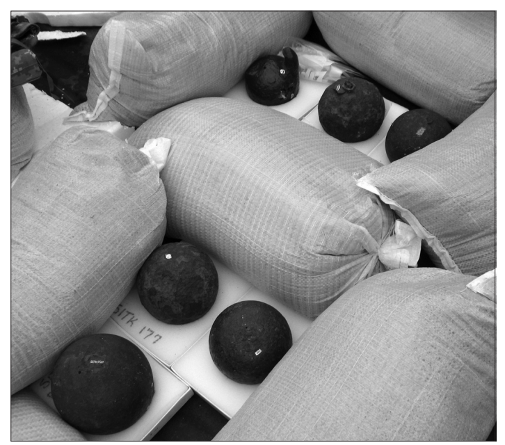
Six cannonballs await their fate on their way to be detonated.

blast subsided, all I could think was, "How could anything survive that?" Five more blasts came shortly after—one for each of the remaining armaments. The team went back to the site along with one of the police officers. The police officer, who came back before the EOD team, disclosed that we shouldn't have our hopes up for having just a hole punched in the cannonball.