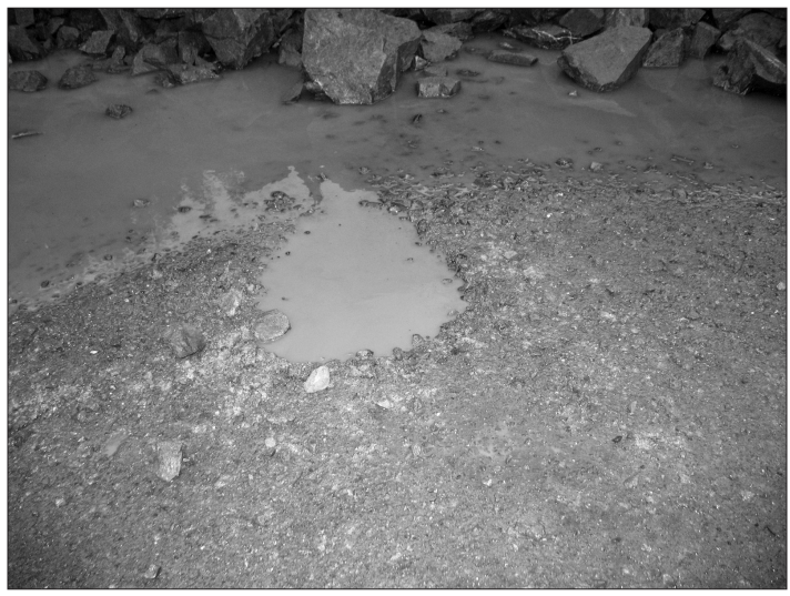
A large hole is all that is left of cannonball V-A-114.

As we left, I kept thinking that maybe we could have just kept them in storage, as they have been for so many years. But I also thought, "No, what if someday someone didn't handle them correctly or there was a fire?"