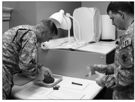
The EOD team pronounces the shell cap safe.

The site for the disarming was a local rock quarry. Immediately, the team set about preparing shaped charges in hopes of making a hole in the side