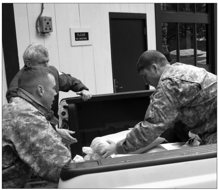
The cannonballs declared dangerous are loaded into a police pickup for transport to the quarry.

When all was clear, one of the soldiers called out in a loud voice in three directions, "Fire in the hole... Fire in the hole... Fire in the hole." A remote device was used to initiate the blasts. One of the museum's cannonballs was the first in line. As the boom from the