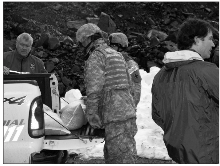
The cannonballs are carefully unloaded at the quarry.