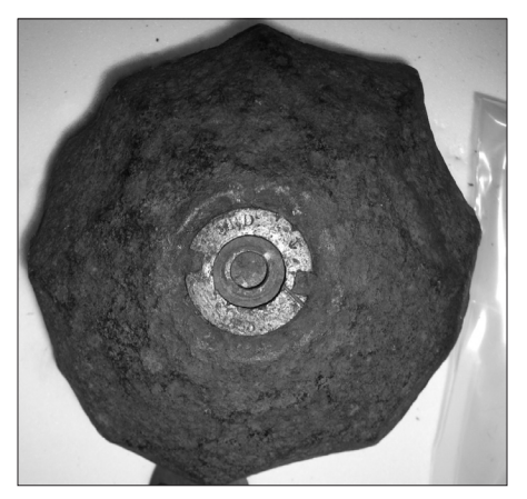
Shell cap from 60-pounder Parrott type II shell.

However, it was recently brought to my attention that the ordnance in