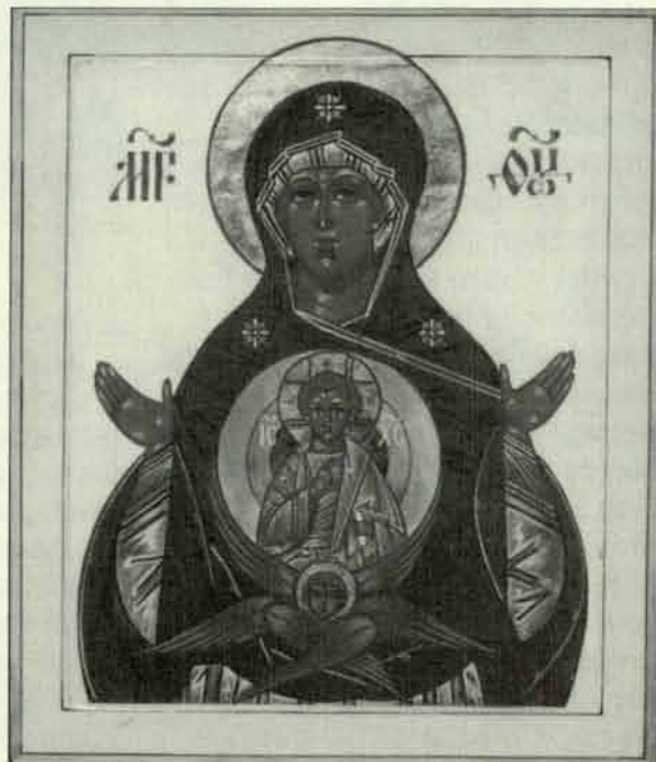
The Virgin of the Sign icon

St. Mary of Egypt is the verbal icon of repentance for Eastern Christians. St. Mary was a prostitute who became a desert solitary after undergoing an extraordinary and transforming conversion.