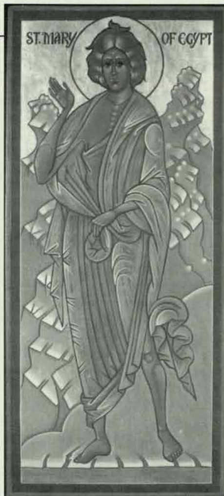
St. Mary of Egypt icon

"Behold, you have driven me out this day from the face of the land; and from your face shall I be hid;