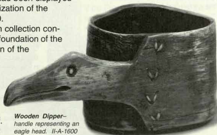
Wooden Dipper— handle representing an eagle head. II-A-1600