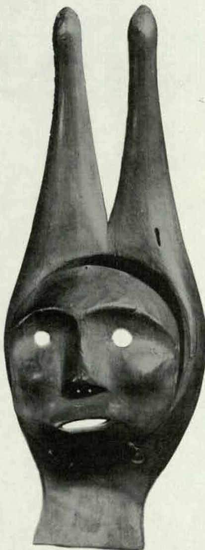
Box -Western Eskimo craftsmen have delighted in playing with box forms and have created pieces which show their skill and creativity. This box out of a single piece of wood from Little Diomedea has a well-modeled face that actually serves as a lid attached to the box by thongs. II-A-1599

Neuman was recorded as absent from the November 1923