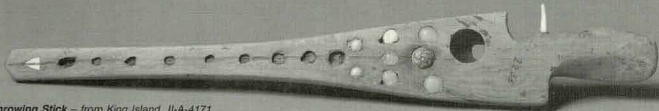
Throwing Stick - from King Island II-A-4171

common in the reindeer which formed an important part of the Inupiat diet.